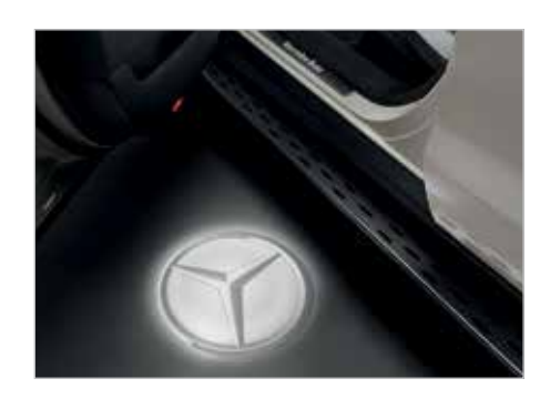
LED Door Projector