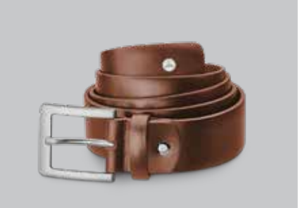
Men's Business Belt (brown)